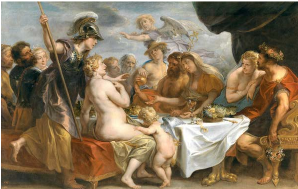
Jacob Jordaens's "Marriage of Peleus and Thetis" (1636-38) is coming to the Clark Art Institute in Williamstown, Mass.